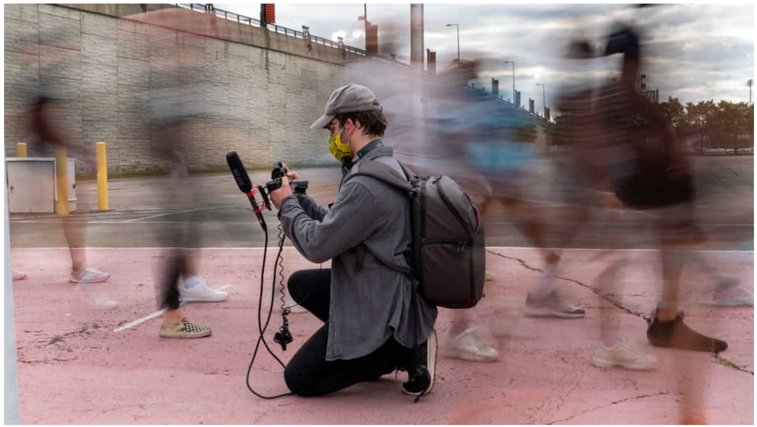
Louisville Public Media